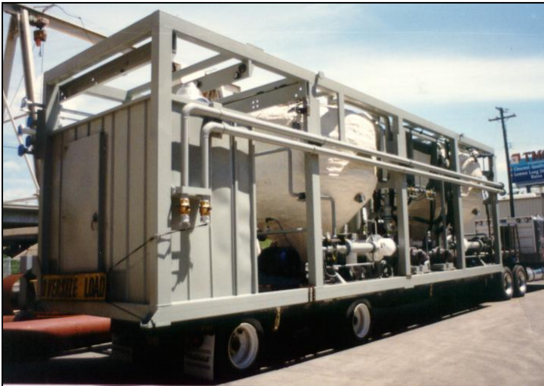
Photo 5. Factory tested module ready for shipment

Factory module pre-assembly and vigorous testing guaranties high quality and reliability of the system and reduction of the time for final assembly and startup. Highest quality parts are used during the equipment production.