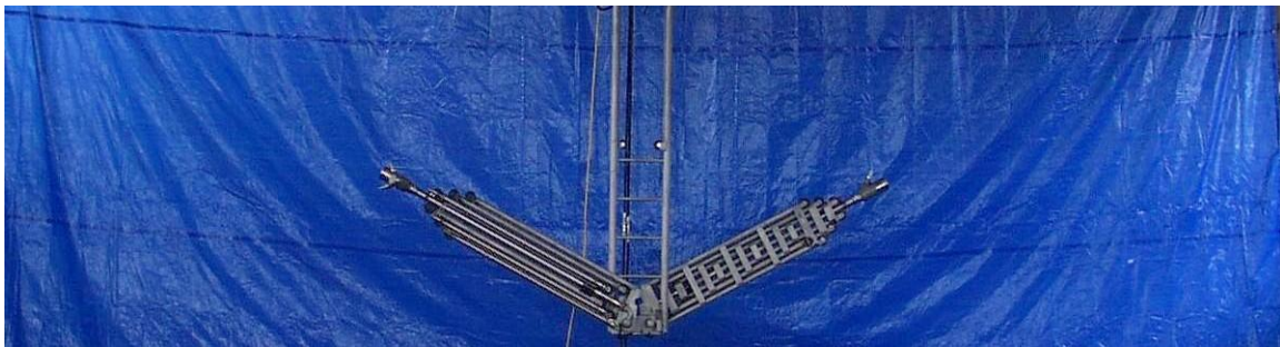
Photo 2. Unfolding telescopic apparatus