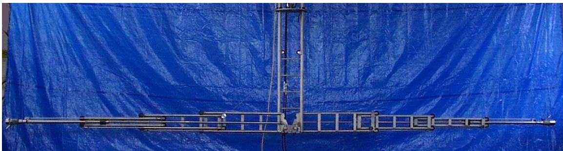
Photo 3. Extending telescopic apparatus