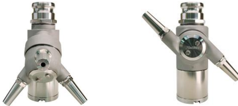
Photo 4. General view of orbital washing heads with three or two nozzles

The telescopic washing apparatus is equipped with two orbital washing heads at its ends (see Photo 4). Each orbital washing head is rotating around the horizontal and vertical axes, driven by pressure of the washing liquid (see Pictures 2a and 2b). Pattern formed by the liquid jets covers all interior surface of the tank. High-pressure hot liquid jets provide strong cleaning effect to remove any residual product and sedimentation from the tank.