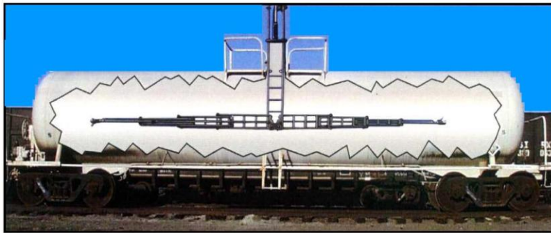
Picture 1. Unfolded and extended telescopic apparatus inside tank car

The telescopic washing apparatus is equipped with two orbital washing heads at its ends (see Photo 4). Each orbital washing head is rotating around the horizontal and vertical axes, driven by pressure of the washing liquid (see Pictures 2a and 2b). Pattern formed by the liquid jets covers all interior surface of the tank. High-pressure hot liquid jets provide strong cleaning effect to remove any residual product and sedimentation from the tank.