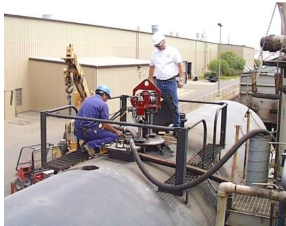
Photos 1a and 1b. Installing telescopic washing apparatus in tank car manway