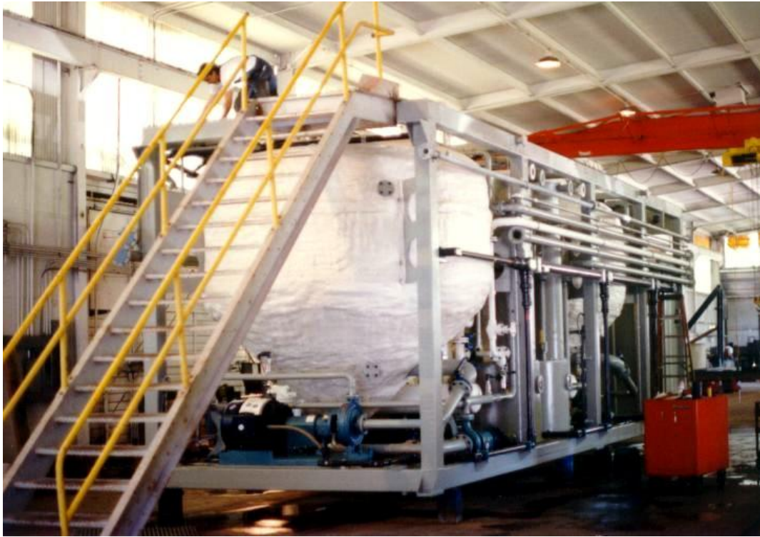
Photo 6. Washing system module installed in a wash shop