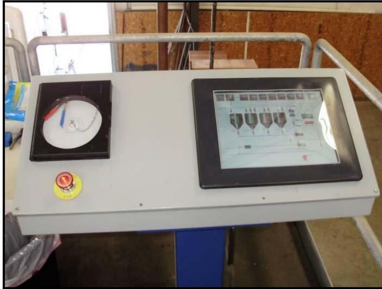
Photo 7. Control panel with touch screen

Control panel for two-car washing system has two screens to control washing of two tank cars simultaneously.